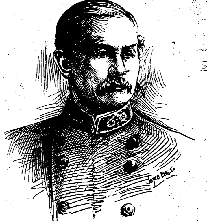
GEN. EPPA HUNTON