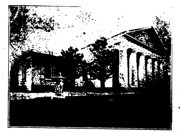
ARLINGTON—THE HOME OF LEE